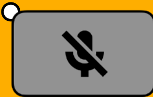
You're On Mute!