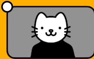
Stuck On Filter