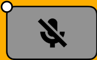
You're On Mute