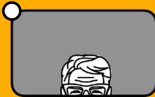
The Bad Framer