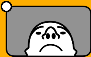
Up Nose View

Get ready for some really substandard camera-work.